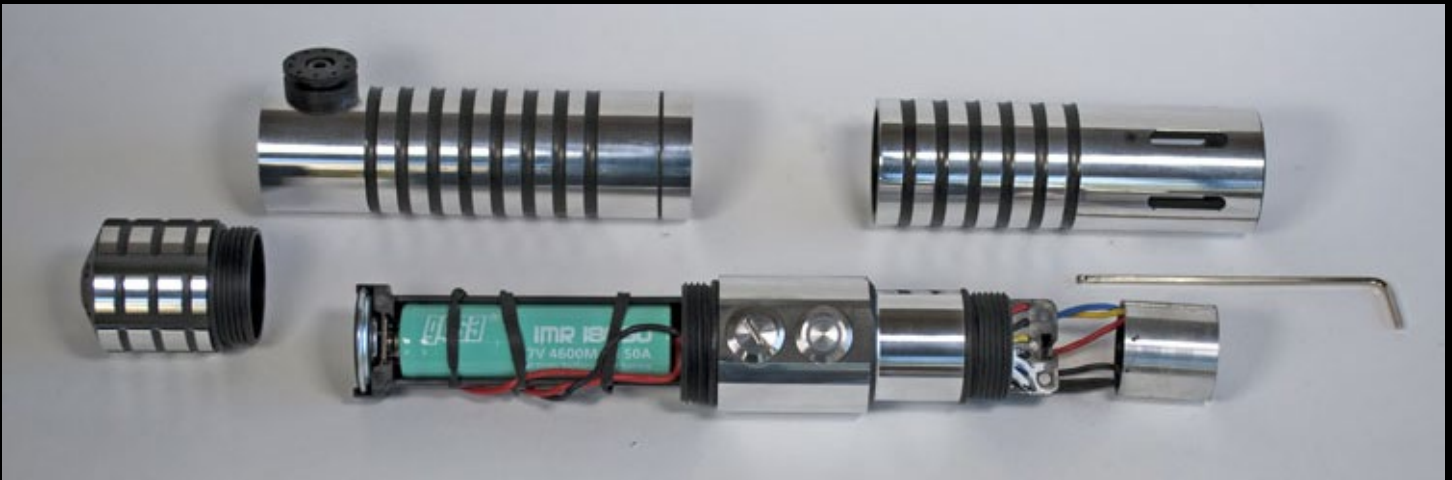
Model: 2200 Deluxe Edition

It is built with competition and frequent heavy saber on saber contact in mind (though can handle bokken and wooden or synthetic HEMA wasters too) but is priced the same as many purely cosmetic sabers available elsewhere. It is truly a breakthrough in the market.